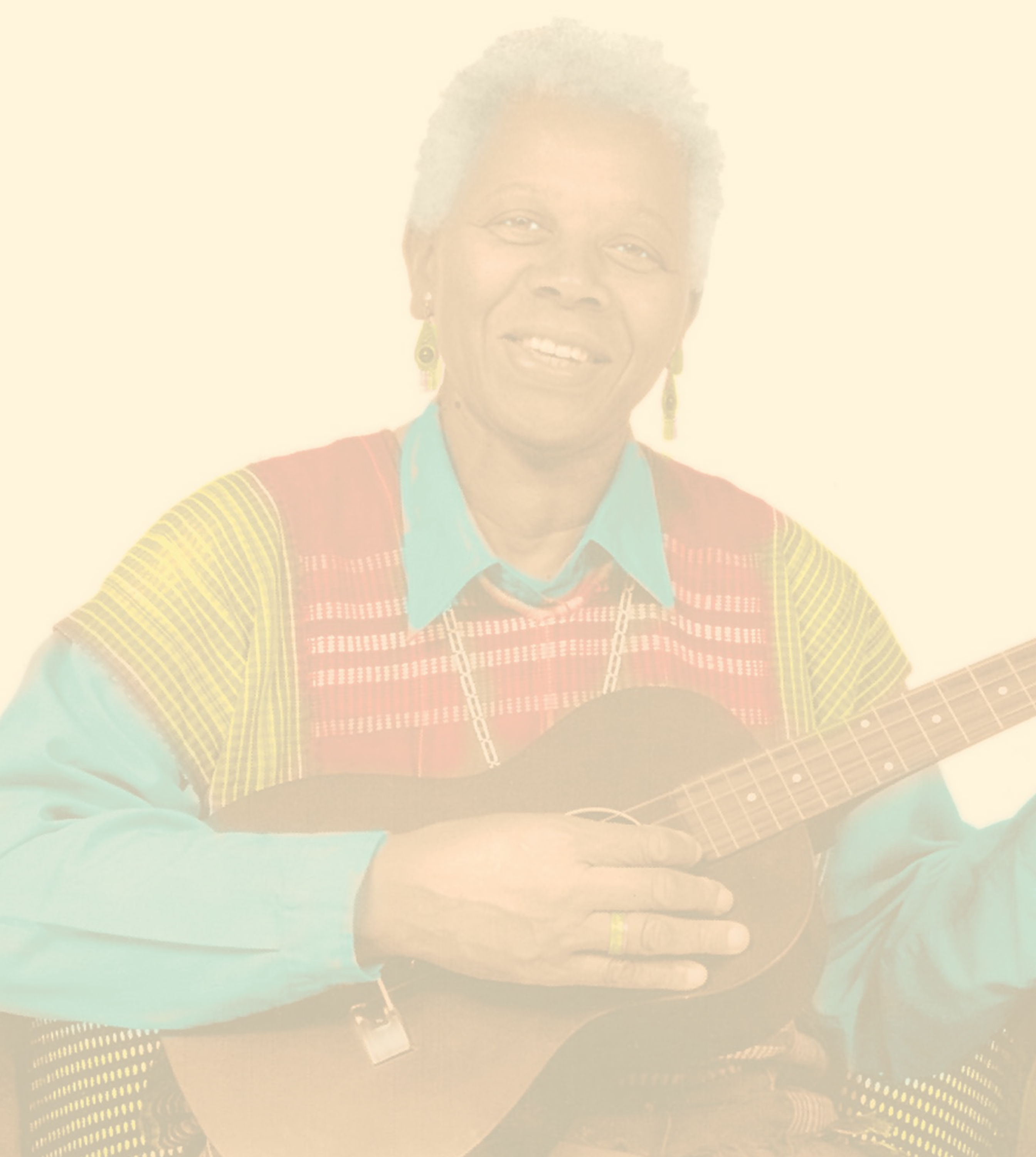
Ella Louise Jenkins

Wherever I've gone I always feel that children have a basic honesty and sincerity. "